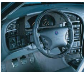
Complete range of accessories for the interior