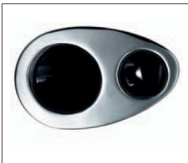
Single or double-pipe sport exhaust systems