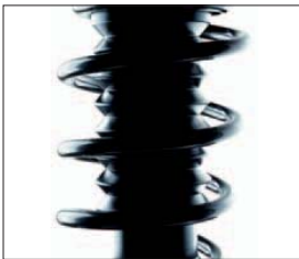
Lowered sport chassis