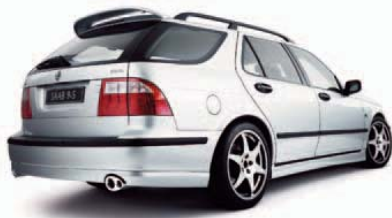
Saab 9-5 Aero and 2.3T (280 HP/400 Nm)

Both versions are also available with automatic transmission!