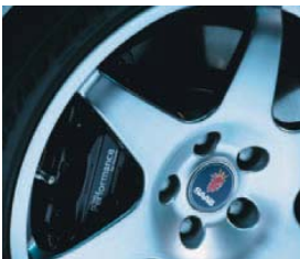
4-piston brake systems