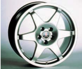
6-spoke 17-inch and 18-inch rims